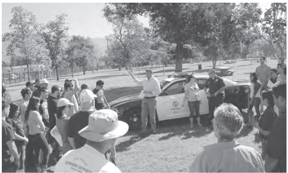
Los Angeles Police Department officers meet with community members, 2015

those they pass or engaging in conversation. This can engender distrust among community members, who come to view the police as an occupying army whose presence in their neighborhood is illegitimate and counterproductive to their community's well-being.<sup>6</sup>