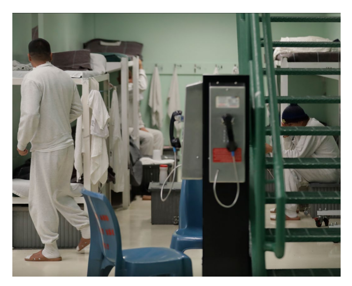
People in detention in a residential pod during a media tour of the U.S. Immigration and Customs Enforcement detention center, December 2019, in Tacoma, WA.