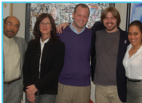
The exhibition's organizing team.