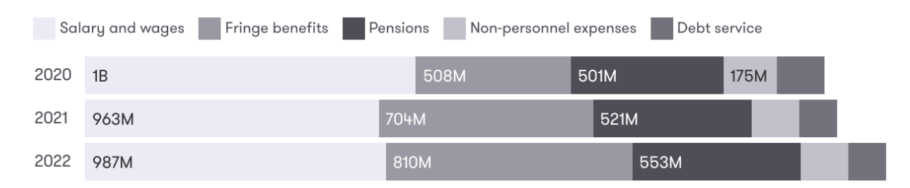
Figure 3: New York City Department of Correction budget, FY2020–2022