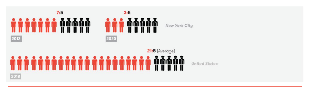
Figure 4: Ratio of incarcerated people to corrections staff, NYC vs. United States

executive budget for fiscal year 2022, Mayor de Blasio proposed a 400-officer and $160 million budget increase, despite consistently low jail population, crime, and arrest rates.<sup>16</sup>