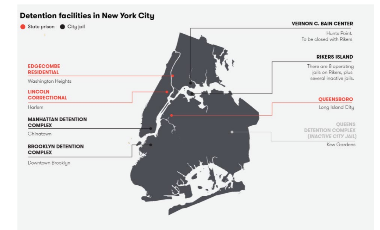
Figure 2: Detention facilities in New York City

Although New York City's jail population declined 52 percent between 2012 and 2020, the city's Department of Correction operating budget grew 24 percent.<sup>11</sup> The average daily number of people detained in New York City jails shrank from 12,287 in 2012 to 5,841 in 2020.<sup>12</sup> Jails experienced a 26 percent population decrease from 2019 to 2020 alone, and all but three active DOC jails were below 60 percent capacity in 2020.<sup>13</sup> Yet, the DOC's budget reached $2.56 billion in 2020.<sup>14</sup>