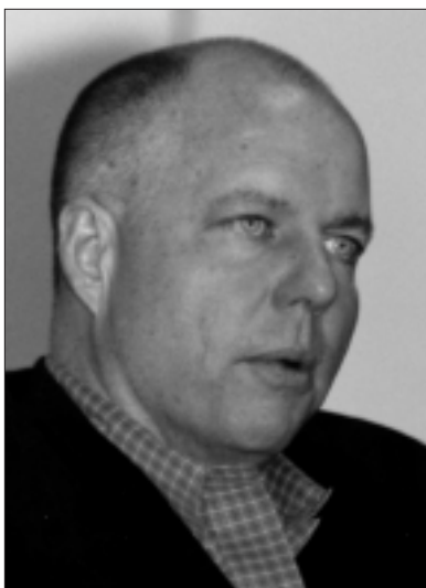
CONNECTICUT REPRESENTATIVE MICHAEL LAWLOR

“I’m as frustrated as anybody about the ineffectiveness of drug treatment programs. But isn’t it fair to ask, what’s the effectiveness of all this incarceration?”