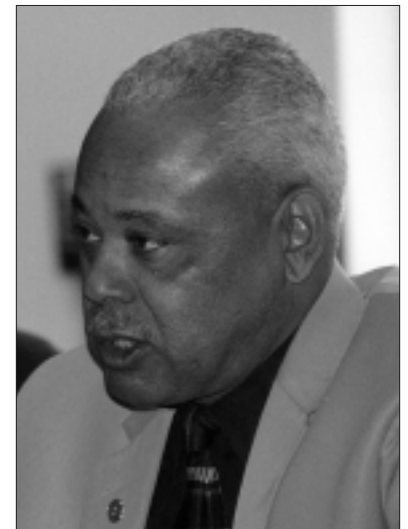
LOUISIANA SENATOR DONALD CRAVINS

"[The budget crisis] will cause us to do better with what we've got."