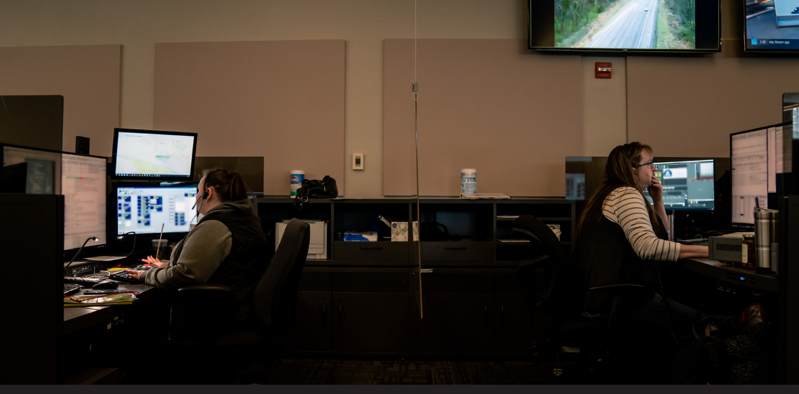
911 operators in Thurston County, Washington's emergency dispatch center.