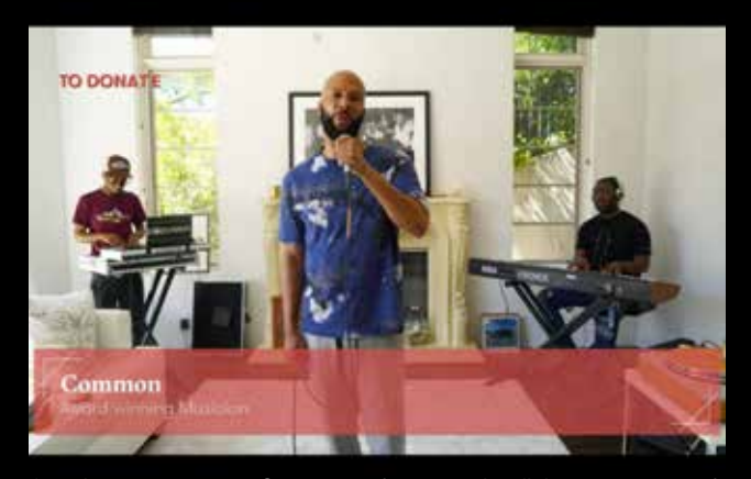
Award-winning musician Common performing with collaborators as part of Vera's 2020 virtual gala.