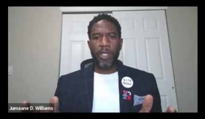
Jumaane D. Williams, New York City public advocate, speaking at Safety for all New Yorkers: Setting the Record Straight about Crime in 2020.